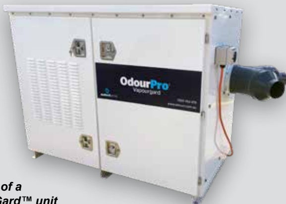
Exterior of a VapourGard™ unit

Some reactions involve the conversion of organic and short-chain fatty acids to esters and simple alcohols. Some complexes trap and adsorb odorous compounds, others use opposing ionic charges to combine with or displace sections of the odorous molecule. Most of the reactions are induced by ionic charge or pH differences. It is very similar to the deodorants and shampoos each of us uses daily. It simply performs in the vapour state rather than the liquid state. The system provides an environmentally and personally safe deodorisation method while conserving water and energy.