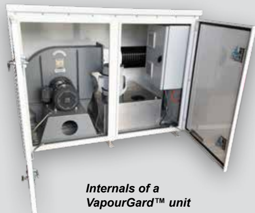
Internals of a VapourGard™ unit